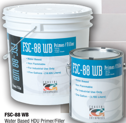
FSC-88 WB Water Based HDU Primer/Filler