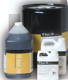
PB Bond-240 One Part Urethane Adhesive