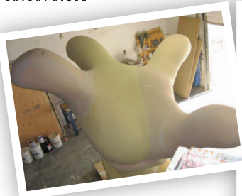
FormaShape 3D Architectural Design Solutions, used PBLT-4 & PBLT-8 for their tooling plug

Scan this image with your smart phone to go to our new website. Request a free sample, request a quote or view our gallery. (Download a FREE QR Code Reader to your Smartphone at www.mobile-barcodes.com )