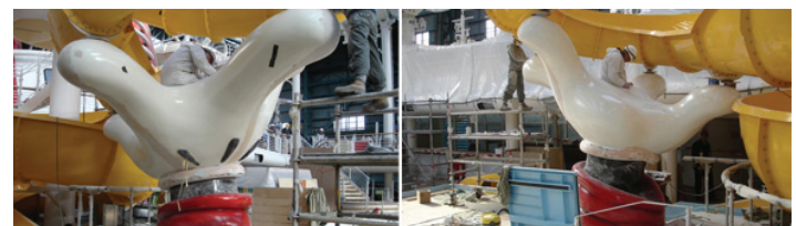
FormaShape attaching the slide flume to the supporting hand