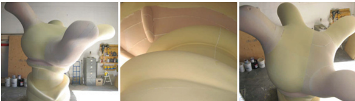
Finished Precision Board Plus plug showing bonded segments used to construct the machining block

Who do you call if you're a discerning family-themed cruise line looking to build a state of the art water slide featuring a signature element from one of your most beloved and iconic characters? The answer is FormaShape 3D Architectural Design Solutions of British Columbia. The design called for a giant replica of the white-gloved hand from everyone's favorite cartoon mouse supporting the main structure of the slide. Patrons had to immediately recognize the hand, so every detail of the larger-than-life appendage became important, right down to the fingers, 3 of them, and thumb... good trivia question!