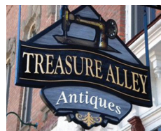
Signs created using Precision Board Plus HDU. The only limit is your imagination.